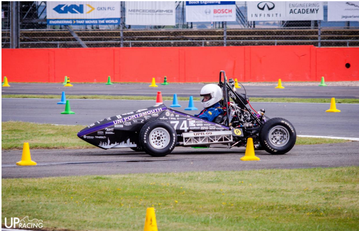
Figure 8 Endurance