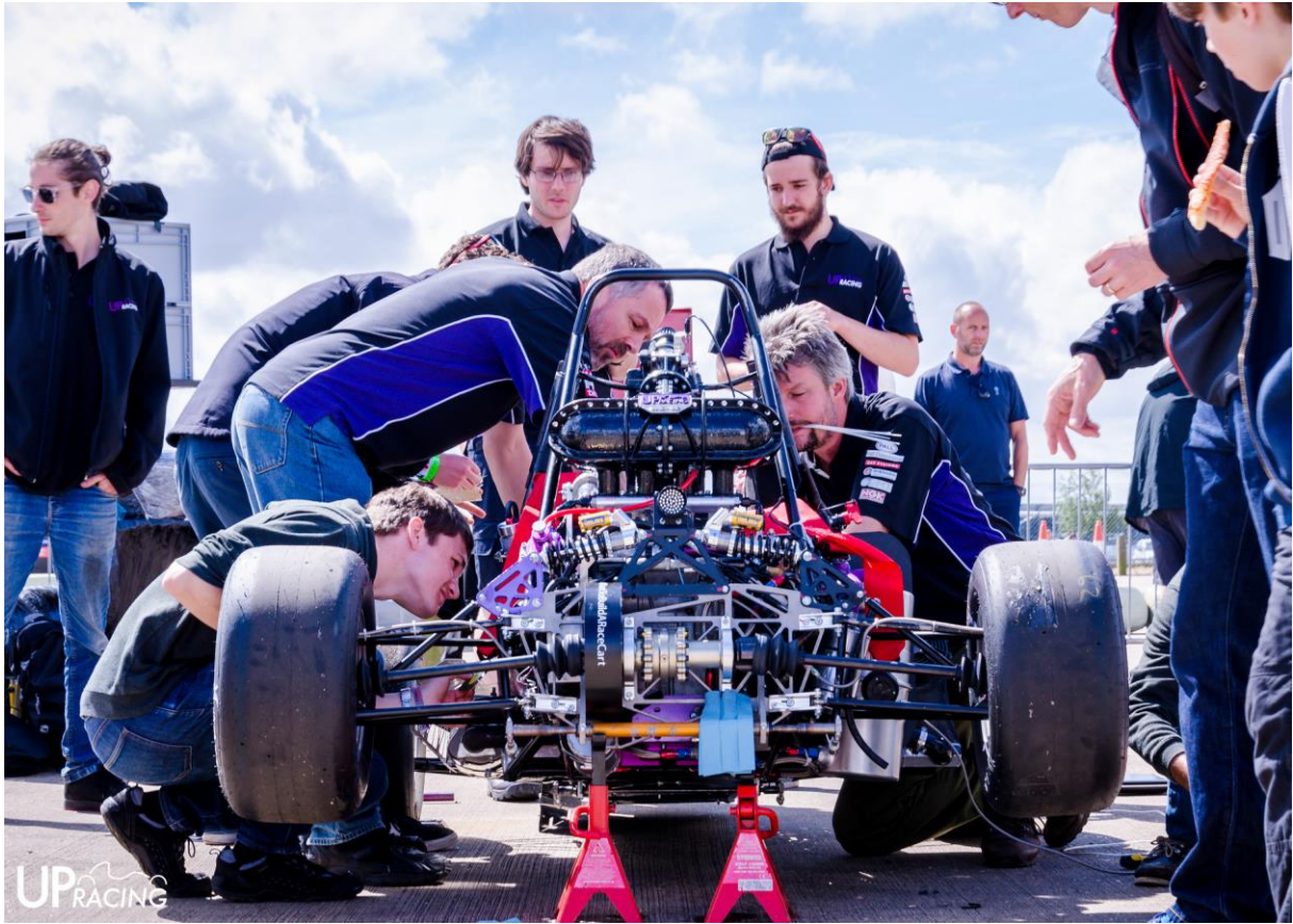
Figure 3 Final preparations for noise test