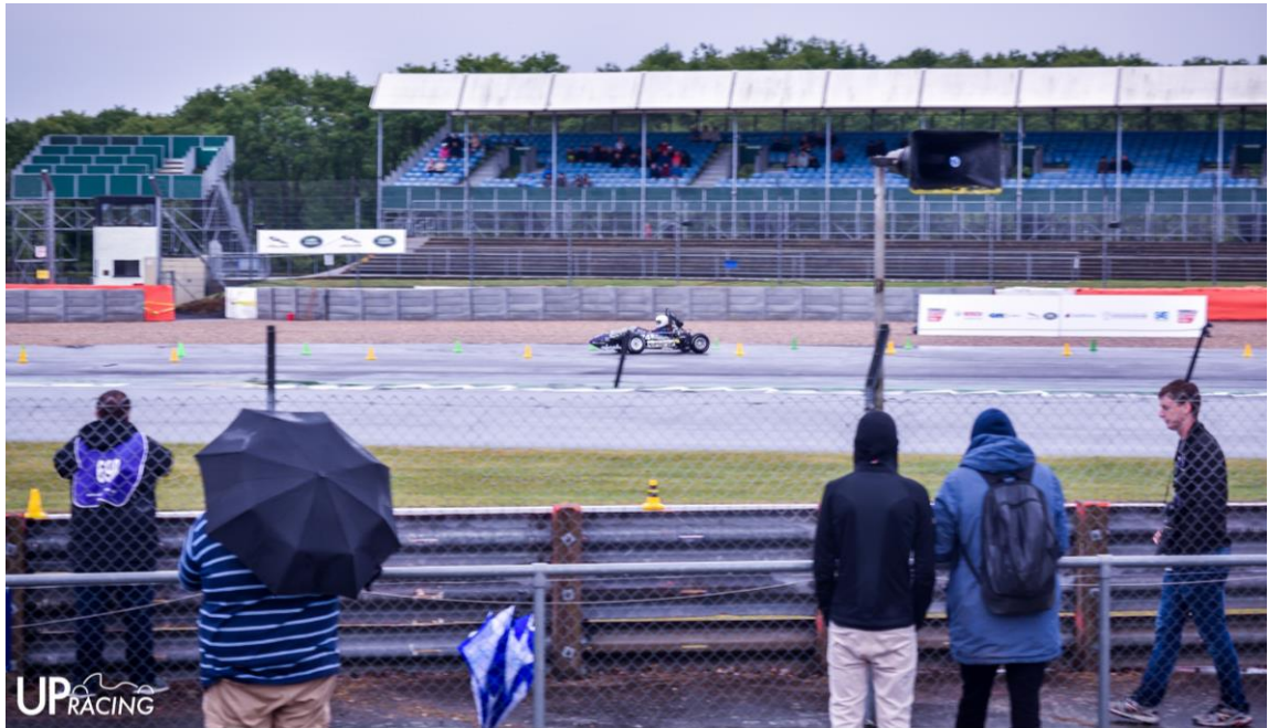
Figure 6 Rain soaked sprint