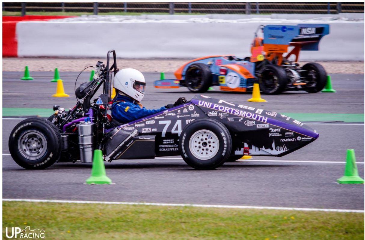
Figure 7 During the endurance