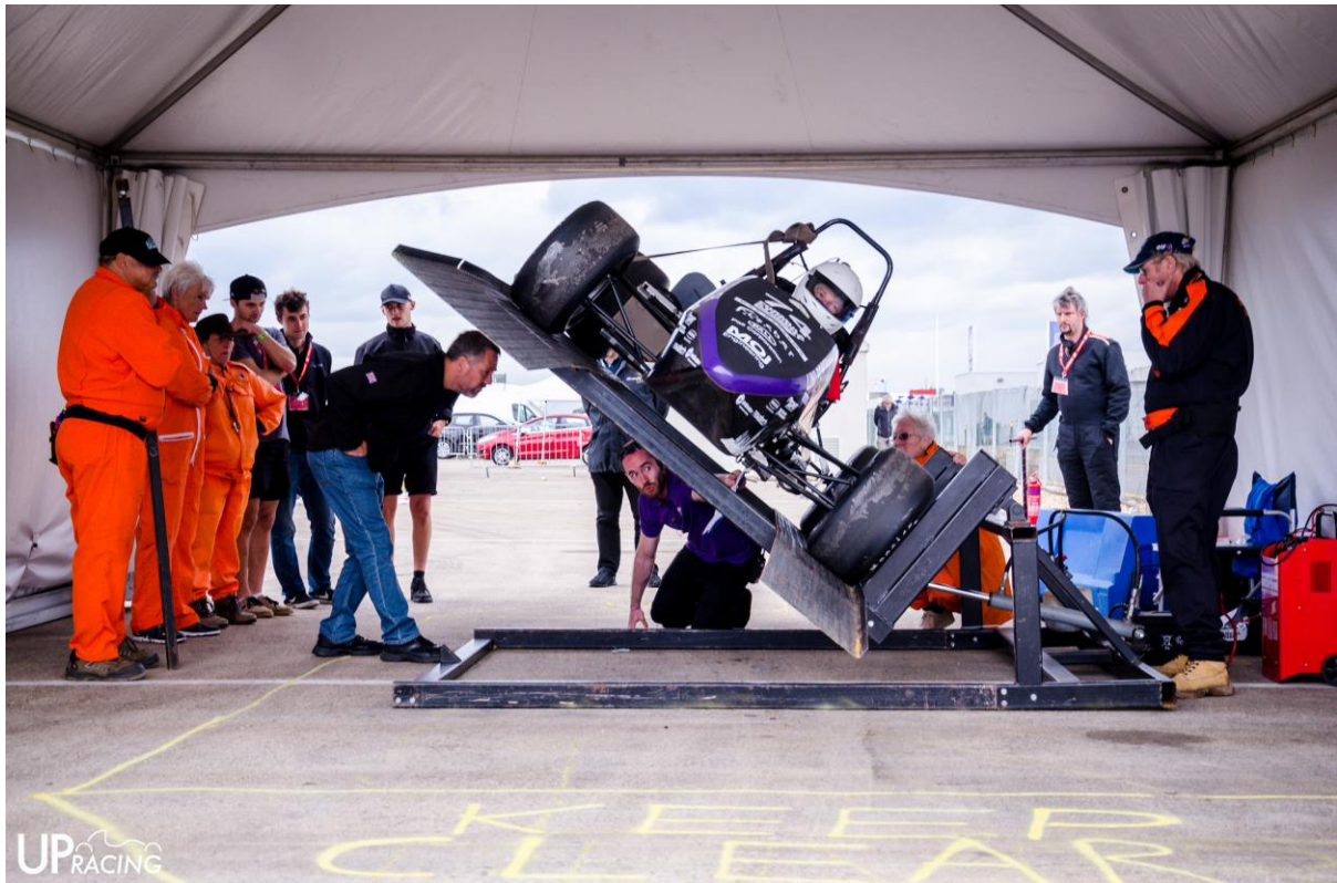
Figure 2 tilt test at 45°

After the static events we only had enough time to do 1 more tilt test before the end of the day. Unfortunately the fuel leak re-appeared. We did however pass the 60° tilt criteria of no wheels lifting. We spent the evening rectifying the problem so that we could pass tilt first thing in the morning.