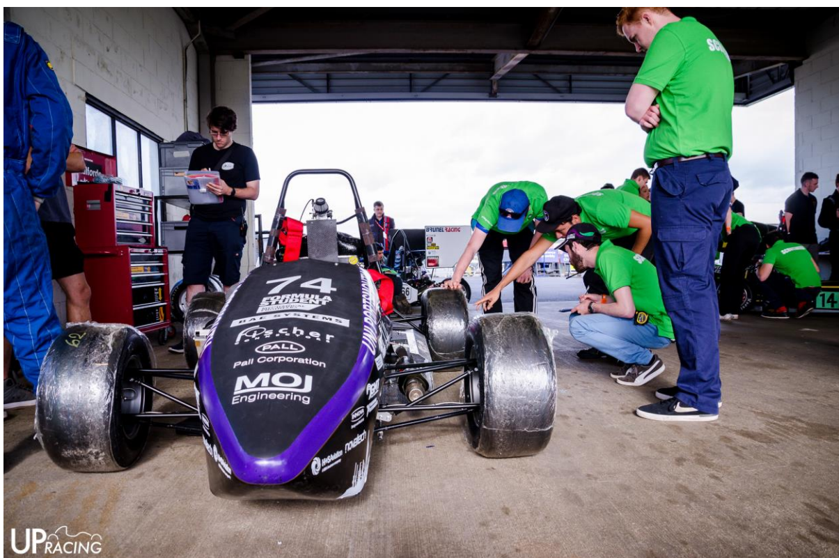
Figure 1 During Scrutineering

We managed to get through stages 1,2 and 3 with only a few minor problems to resolve. These were quickly amended, so we never had to leave our station during the process. Many top teams got caught out by major issues. Passing these stages quickly (within 3 hours) was critical to succeeding and showed good preparation.