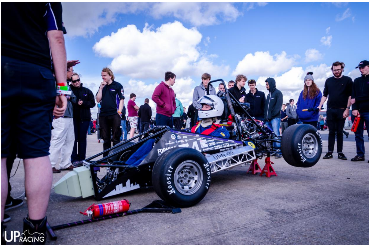
Figure 4 Starting the car for the noise test